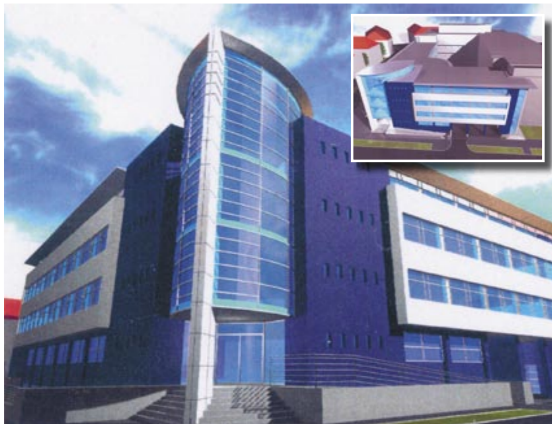
VISUALISATION OF THE NEW BUILDING (picture4) ▼