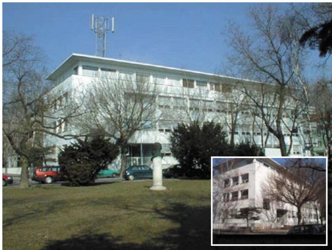
CURRENT BUILDING (picture 3) ▲