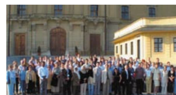
picture 1 ▲

Being a member of PIC/S Scheme since 1996, SIDC was delegated for the first time to organize the annual seminar „The Inspection of Quality Control Laboratories“, which was held